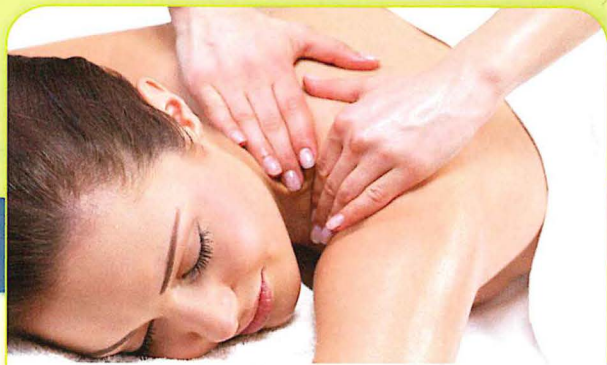
Registered Massage Therapy.